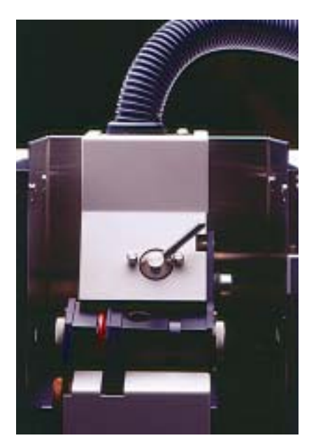
The GF3000 graphite furnace workhead

The provision of two gas supplies gives maximum flexibility for handling the widest range of samples.