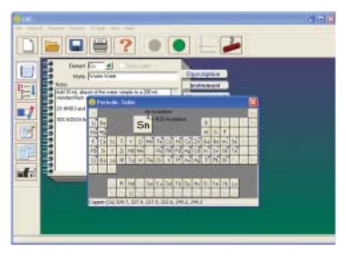
Element selection is made easy with SensAA software

• The software is available in a wide range of international languages.