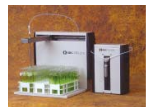
SDS-270 Sample Delivery System